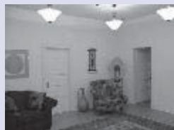
the common living room

As we complete the first year of the Upper Room Intern Program we are looking at our need to furnish the four bedrooms and living area for the next group of participants coming this fall. This past year was a year of transition. We started out the year with an unfinished space and throughout