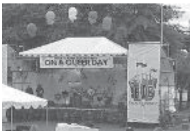
"On a Queer Day" - reads the sign on this day of pride.

Paul writes that we all have sinned and fallen short of God's glory and are in need of the message of the cross. Sadly, many not only continue to do the very things that oppose God, but they also approve of those who practice them (Romans 1). Every Father's Day a very ironic, yet sad event takes place in Portland; the annual Gay Pride Parade. The day in which Fathers are to be celebrated, is the day when many men and women with wounds from their own fathers find comfort and peace with one another.