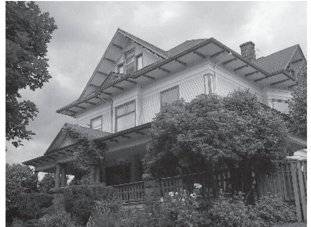
In 1993, this wonderful turn-of-the-century house became the home PF where it continues to be a beacon of hope in the Hawthorne neighborhood.

Clearly, the stakes are high and this house purchase is a crucial component of our ability to carry out God's call for this ministry. Fellowship House is an easily accessible, centrally located safe place with functional meeting and office space—allowing us to effectively minister to current needs as well as plan for future growth in our program and service offerings. Moreover, the equity