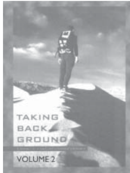
The year 2 workbook is headed toward printing later this year.