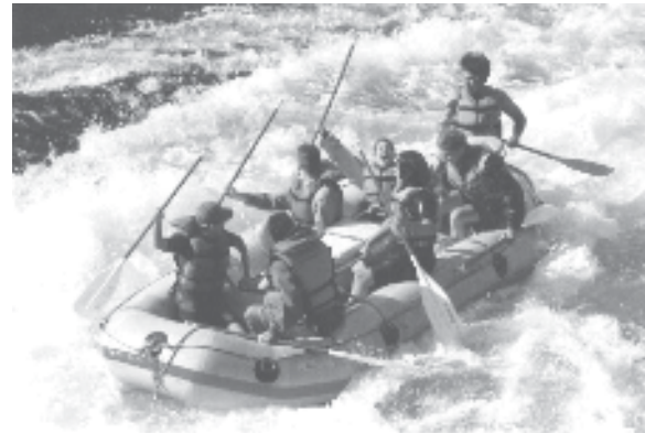
"An Adventure to Live"