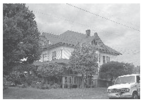
Our turn-of-the-century house is being offered to us for purchase.