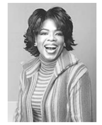
Harpo Studios 1058 West Washington Chicago, IL 60607

As we watched each graduate testify to what God had done in his or her life over the last two years we can only wonder what their story would be if they had chosen to go with the wisdom of this world. We also wonder what the culture would be like if these men and women had the opportunity to share their stories on these popular shows.