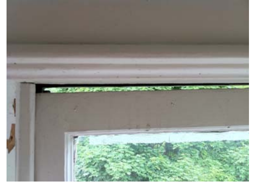
Eight windows had gaps like this. take note: this is in fully closed position

Everyone who uses this house will be pleased to open windows on hot days, for the first time in years (maybe decades), as well as feel the warmth and comfort this coming winter. Thank you, Lord, for your ongoing provisions through your people year after year.