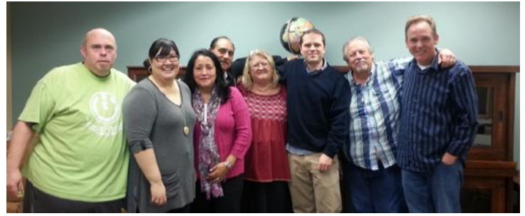
The newest church to use the Taking Back Ground program New Hope: a ministry of Golden Hills Community Church