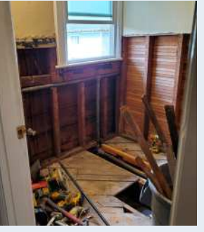
2nd floor bathroom: BEFORE