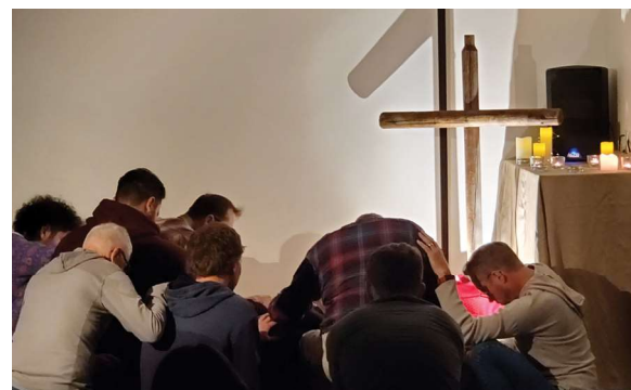
The 2024 TBG Surrender Service.

I remember when we came up with the idea for the surrender service at our first retreat. We instructed individuals to pray and ask God to show them something that symbolized their struggle that they could, with explanation, publicly surrender to God